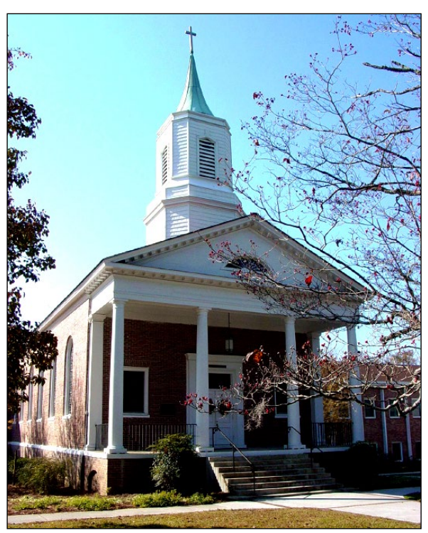
Bethany United Methodist Church Spell Chapel ~ 8 o'clock a.m.