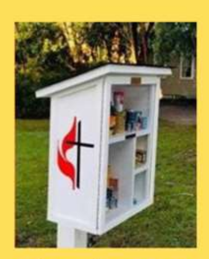
Blessing Box Donations Needed

You can drop off donations in front of the Business Office door during the week or on Sundays. The following are needed: